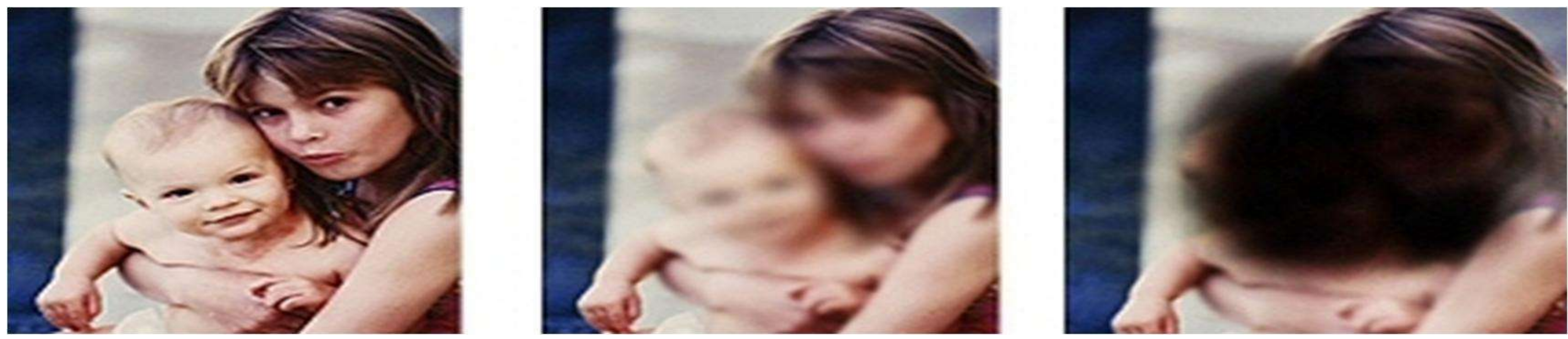
Normal As Age Advances